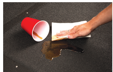
Durable Rubber Floor